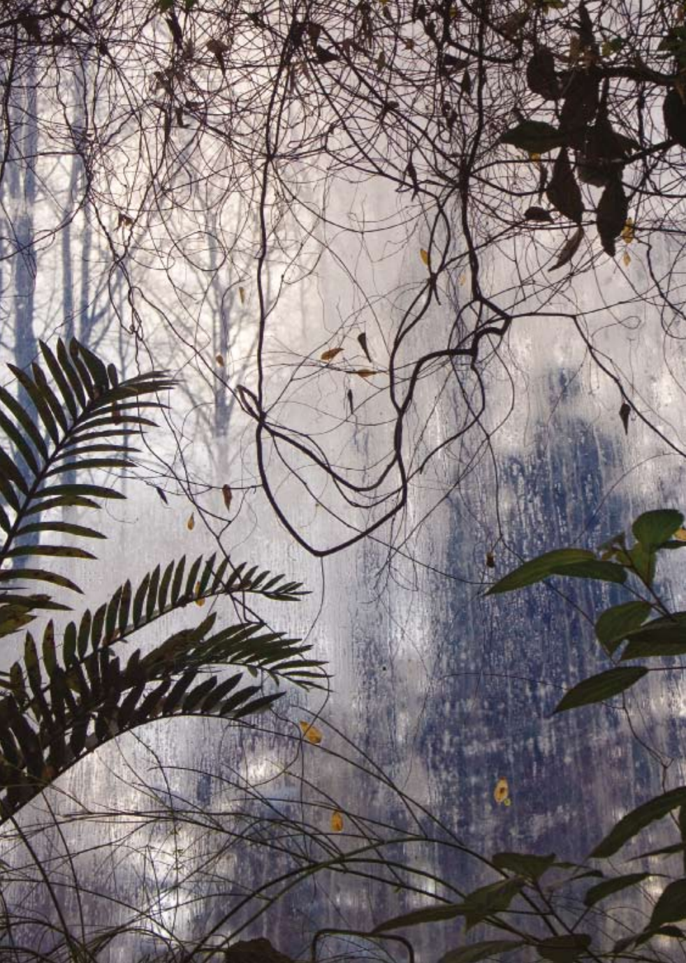
MIMESIS 1 Florence Zurich, Switzerland